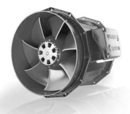
The optimized shape of the impeller provides a pure, exceptional air stream.

Thanks to its compact size, the circular duct fan matches the duct dimensions. A truly tiny inline solution.